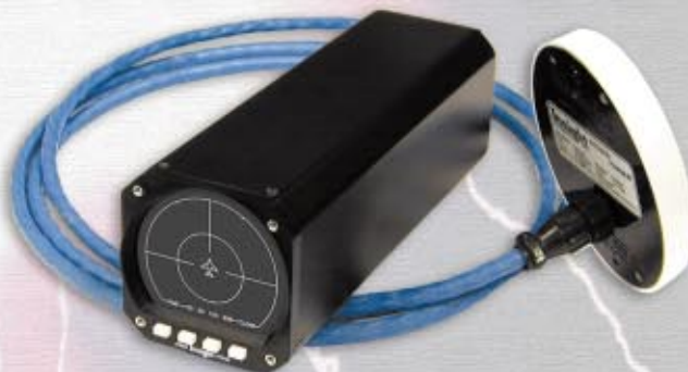
Display/Processor, Connecting Cable and Active Sensor